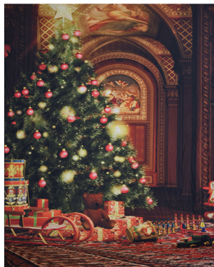
Example of Holiday background

All portraits carry a 100% money back guarantee.